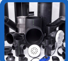
PIPES & FITTINGS